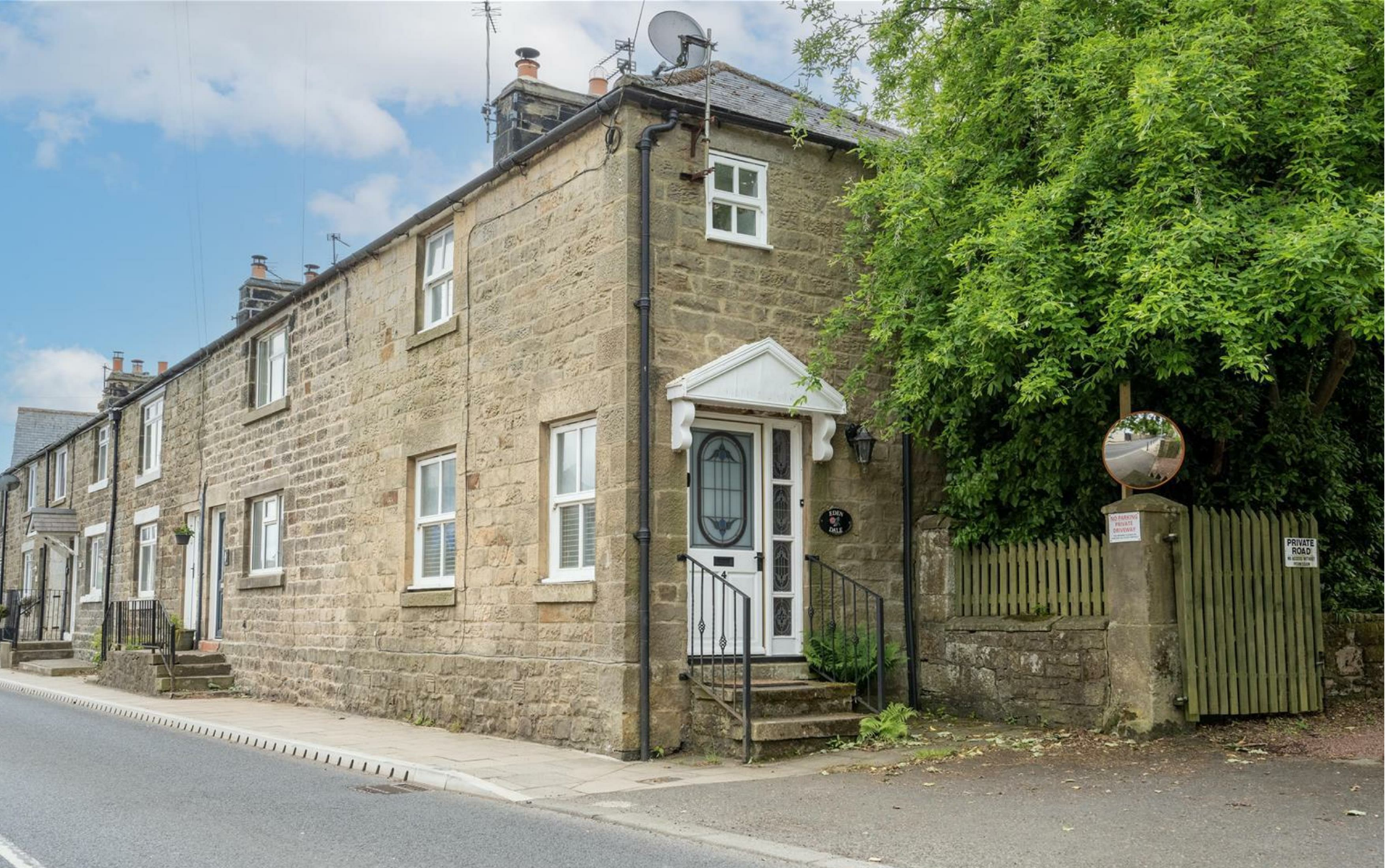
📍 Front Street, Morpeth NE65 8DR